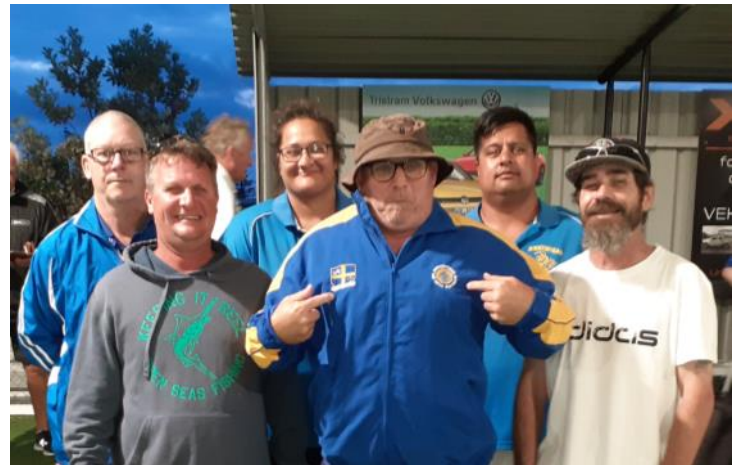
Birkenhead's winning 1-5 Year Interclub side: