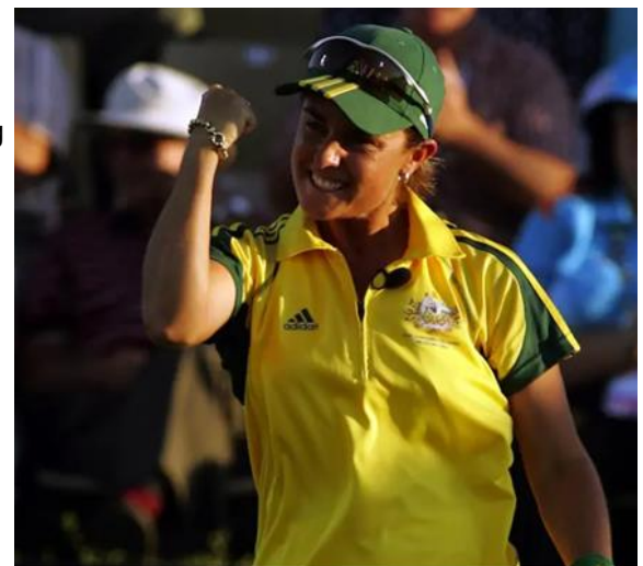
Australian bowls legend Karen Murphy will be on the North Shore in February.